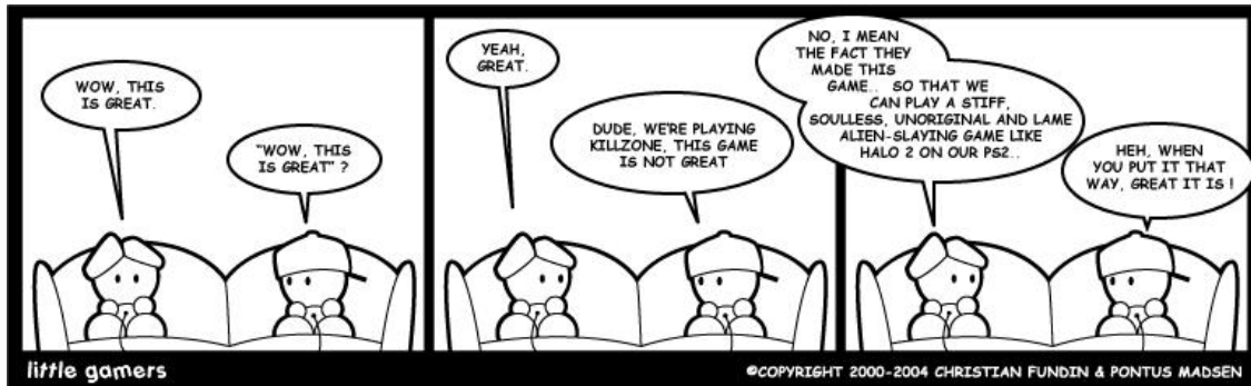
Figure 2: Little Gamers: Halo 2 and Killzone (11-08-2004)